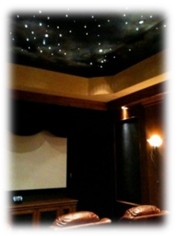
Fiber optic stars are a lighting option.

23. If the seating is tiered, the concrete or framing/electrical will also be determined by the spacing requirements.